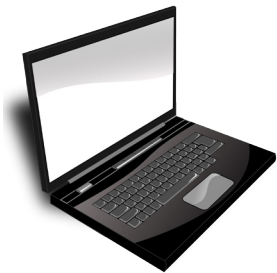
ACCU-DART updates directly into the ERP system.

Buy Only the Modules You Need. WMS systems that employ a separate database often require you to process all your inventory transactions through their system. You therefore need to purchase a package with all the functionality – whether you need it or not. By integrating directly with your ERP data, ACCU-DART can be implemented on a mix and match basis. For example, you can use ACCU-DART to ship inventory and use your ERP system to receive inventory. You could even ship some orders using scanners and other orders using the ERP system. Because we are using your ERP data, ACCU-DART doesn't care how the data was updated. You can add modules as needed.